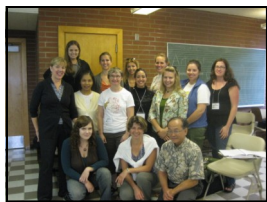
Violin Book 1 class Japan Seattle Institute