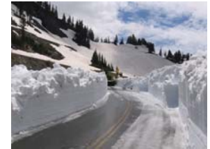
Roads can be wet, icy, or snowy during winter in Denver. Drive slowly and use caution!

Avoid stopping abruptly, as you may lose control of your vehicle on icy or snowy roads. Instead, apply gentle pressure on your breaks and allow more time to come to a stop.