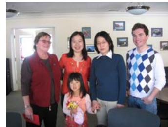
Come make new friends at the International Spouses Group!

ISSS looks forward to welcoming international spouses on Wednesday, October 7th!