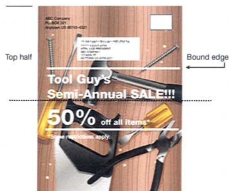
Catalog addressed on back cover. "Top" is the upper edge when the spine is on the right.

You can place the delivery address on the front or the back of the mailpiece, but it must be on the same side as the postage. The address may be parallel or perpendicular to the top edge, but not upside-down as read in relation to the top edge. A perpendicular address can face to the left or the right.