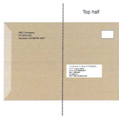
Large envelope. "Top" is the left or right edge as viewed in this horizontal orientation. The "top half" could be either the left or right half.