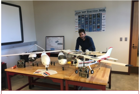
wing CC fleet

(using upper trailing edge blowing) to improve its aerodynamic performance and provide unique capabilities on the aircraft. What converts any conventional UAV to the proposed UC<sup>2</sup>AV is the novel and complete Circulation Control (CC) system, which consists of custom-built CC wings (CCWs), air supply unit (ASU), air delivery system (ADS) and two plenum designs that provide flow uniformity across the Dr. Kostas Kanistras with the DU2SRI fixedspan of the wing. The CC system is built into the aircraft structure as a whole and it is part of the structure itself; although components may be built as a separate item, the whole system functions as one integrated aircraft. Using CC, the aircraft is endowed with improved aerodynamic efficiency (enhanced endurance), increased useful payload (fuel capacity, battery cells, on-board sensors), delayed Email: Kimon.Valavanis@du.edu stall, and reduced runway during take-off/ landing.