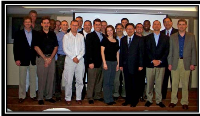
Cohort 6 March 2009 travel seminar to Hong Kong.

All students enrolled in the ITI Executive Masters Program attend an Intermodal Transportation Travel Seminar to an international location. In previous years the ITI students have visited Vancouver, Canada, Europe, Hong Kong, and Shanghai. This year the location was again Hong Kong. The travel seminar, which serves as a capstone for the graduate program, helps students understand the practical challenges of creating and sustaining intermodal transportation systems—both freight and passenger—by providing opportunities for discussion with government and industry leaders engaged in managing, operating, and maintaining these systems. Students also learn about international security systems and are able to observe new and developing technologies in action; and they are encouraged to use the public-transit system whenever possible.