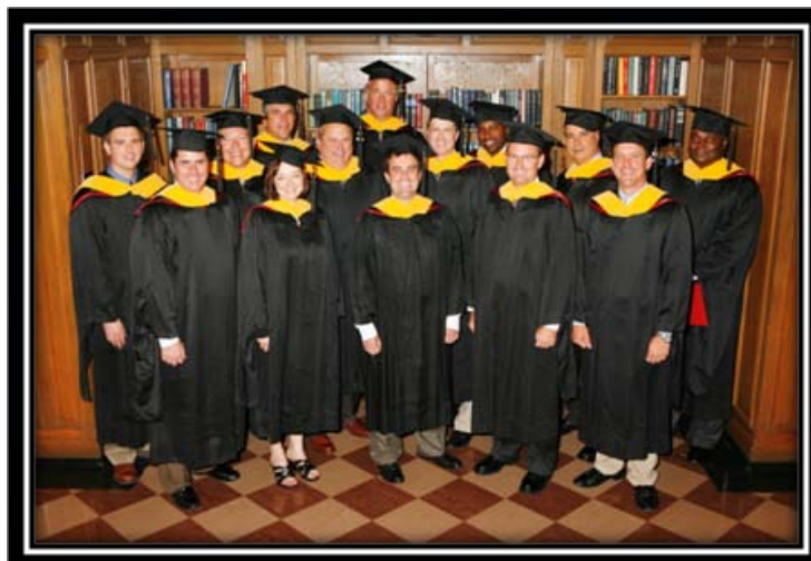
Cohort 6, which consists of 17 students, graduated with their MS in Intermodal Transportation Management on 5 June 2009. All students but two were able to attend the ITI Graduation Reception and Hooding Ceremony with their families.