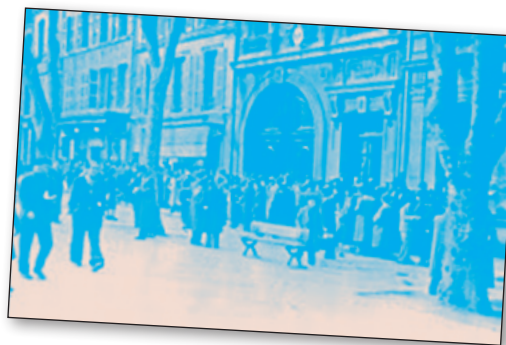
Refugees at the U.S. Consulate, Marseille 1940