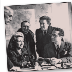
Max Ernst, Jacqueline Lamba, André Breton, Varian Fry