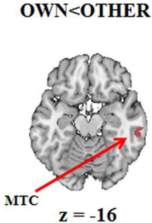
Figure 3. Activation map of OTHER>OWN.

The graphical representation of brain regions consistently activated across studies in the contrast OTHER>OWN. Max cluster size computed at p < .001 and p < .01 (whole brain p(\text{FWER}) < .05 ). Abbreviations: MTC=middle temporal cortex.