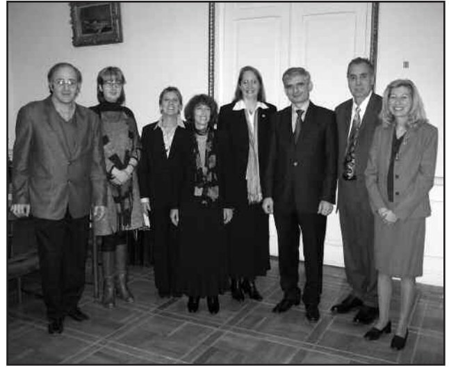
Above: Project team members from DU and TSU pose with TSU's Rector.