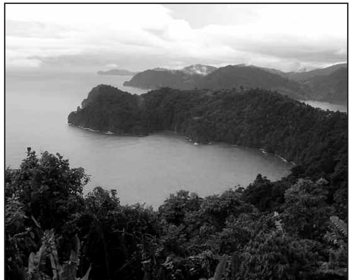
The island of Trinidad offers incredible beauty.