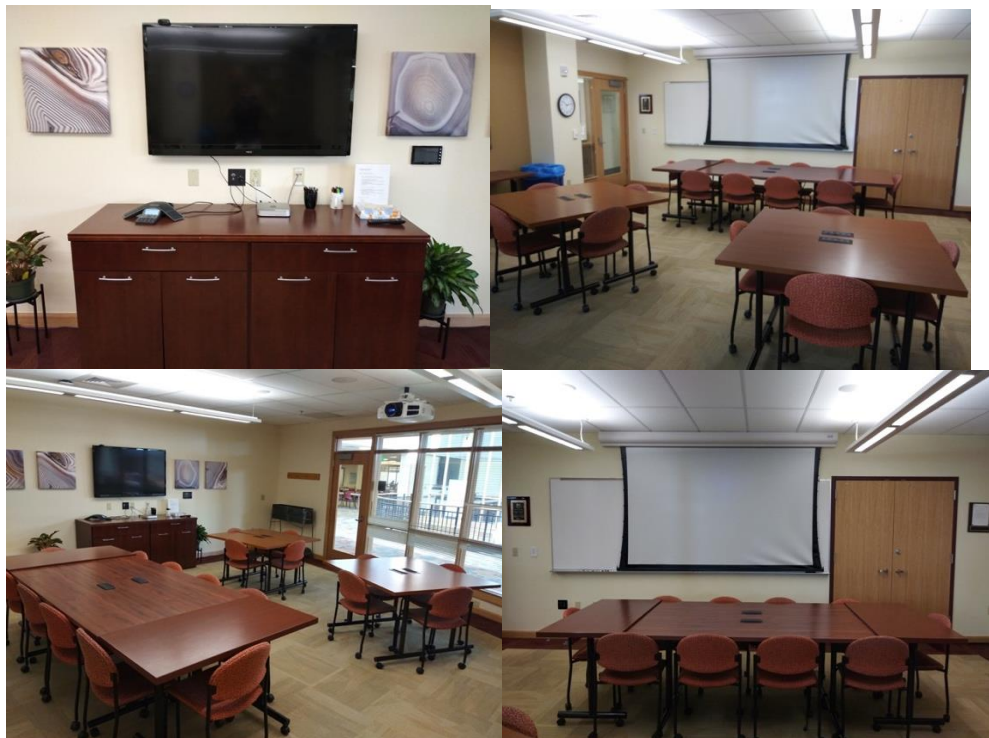
Table 1, Table 2, Table 3, Table 4