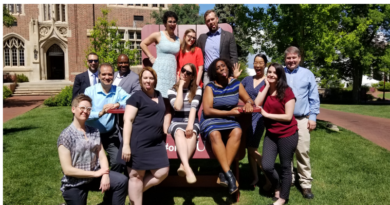
Leadership Academy Cohort-4

The Leadership Academy is a professional development program for staff and faculty with an emphasis on developing the leader from within. This six-month program consists of half-day sessions of learning modules, discussions and practical applications of leadership and personal development principles with an emphasis on self-awareness. In addition, this program requires vulnerability, hard work, dedication and commitment and includes a group project and individual commencement speeches at graduation. This program is coordinated by the People Development team in HRIC.