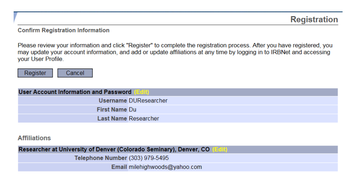
Step 8: Confirm your IRBNet Registration

Step 7: Review the information you provided and edit as necessary. When you are satisfied, click 'Register'