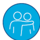
Coaching & Support