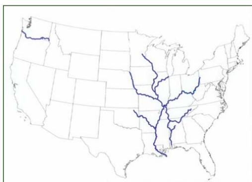
(a) Agriculture Significant Waterways

Different transportation modes can be used to ship ethanol. The same is true for DDGS and biomass. The choice of a transportation mode depends on the distance between origin-destination of a shipment, and the proximity to intermodal facilities (such as rail terminals, sea ports, in-land ports, etc). Due to the high cost of transporting biomass, 76% of ethanol produced in the USA comes from small-sized biorefineries located in four major corn producing states in the Midwest. Collecting and transporting biomass within a 50 mile radius is the economic threshold that has been used in the literature. Mahmudi and Flynn (5) show that the shipping distance (for wood chips) beyond which rail is more economical than truck is 145km (90miles). The increased demand for ethanol and economies of scale (in utilization of byproducts and distillation of ethanol) favor larger scale facilities. Larger biorefineries imply a larger number of biomass suppliers, longer transportation distances, and higher shipping volumes.