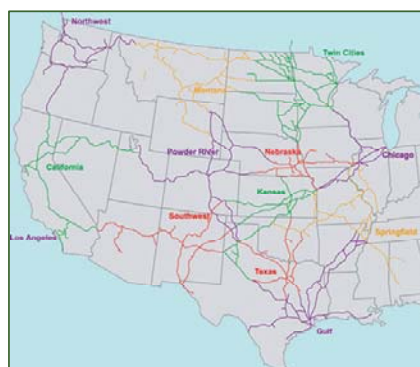
(b) BNSF Rail Map