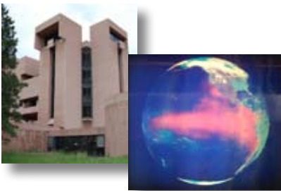
NCAR building and image showing ocean temperature

Post Conference Field Trips Two post conference field trips allowed participants to observe collaborative governance on climate change in action in Colorado. The first trip was to the National Center for Atmospheric Research’s Mesa Lab (NCAR) in Boulder, which performs research regarding the earth’s climate and predicting future changes. Dinner at the Dushanbe Tajik Tea House followed.