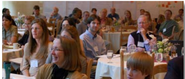
Audience at Professor Michael Dorsey Keynote

OK, be honest. Did you know that it takes 4 liters of water to produce 1 liter of bottled water? That’s right, 3 liters of water are wasted during the production process for creating each single liter of plastic bottled water. What’s more, the great majority of plastic bottles don’t end up in the recycling bin like they should. 90 percent of the time they’ll end up in a landfill, where it can take thousands of years for the plastic to fully decompose. And that’s not even the end of the story—about 1.5 million barrels of oil are used to make plastic water bottles each year, a figure that doesn’t include all the oil burned in transporting the bottles to consumers. Add it all up and the picture becomes clear: Bottled water is terrible for the environment.