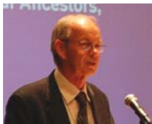
Former Wyoming Governor James Geringer